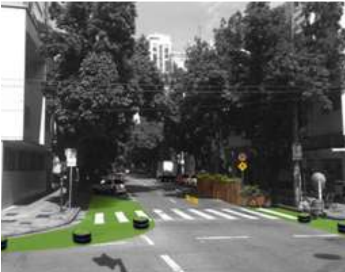
Figure 2: Urban furniture and horizontal signaling