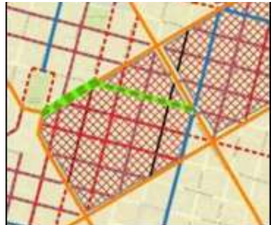
Figure 5: Proposal for pilot-project of Zone 30 and Fahrradstraßen