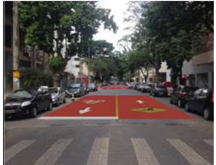
Figure 3: Horizontal signaling for the Fahrradstraße